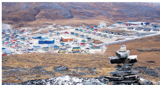
Vue de la communauté inuite de Salluit (Nunavik). Dans le cadre de ses activités, l'Institut nordique du Québec couvre un immense territoire situé au nord du 49 e parallèle.

archéologique et culturel du Québec nordique. En matière de santé, les participants ont insisté sur le leadership que les peuples autochtones du Nord doivent assumer dans l'établissement des priorités de recherche pour leurs régions. On a aussi discuté de la nécessité de concevoir des plans d'aménagement pour les infrastructures de transport afin de rendre celles-ci plus durables et résilientes face aux conséquences des changements climatiques. De