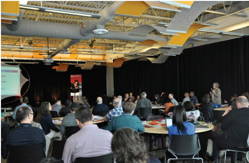
The participants to the Forum on the Research Needs of First Peoples.