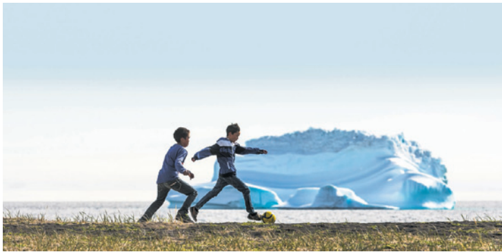
En matière de santé, les participants ont insisté sur le leadership que les peuples autochtones du Nord doivent assumer dans l'établissement des priorités de recherche pour leurs régions.