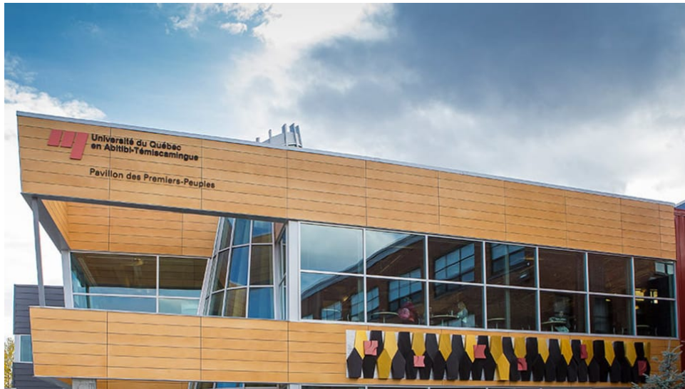
Le Pavillon des Premiers-Peuples du Campus Val-d'Or de l'UQAT

Le Forum sur les besoins de recherches des Premiers Peuples se déroule mardi et mercredi au Pavillon des Premiers Peuples de l'Université du Québec en Abitibi-Témiscamingue (UQAT) à Val-d'Or.